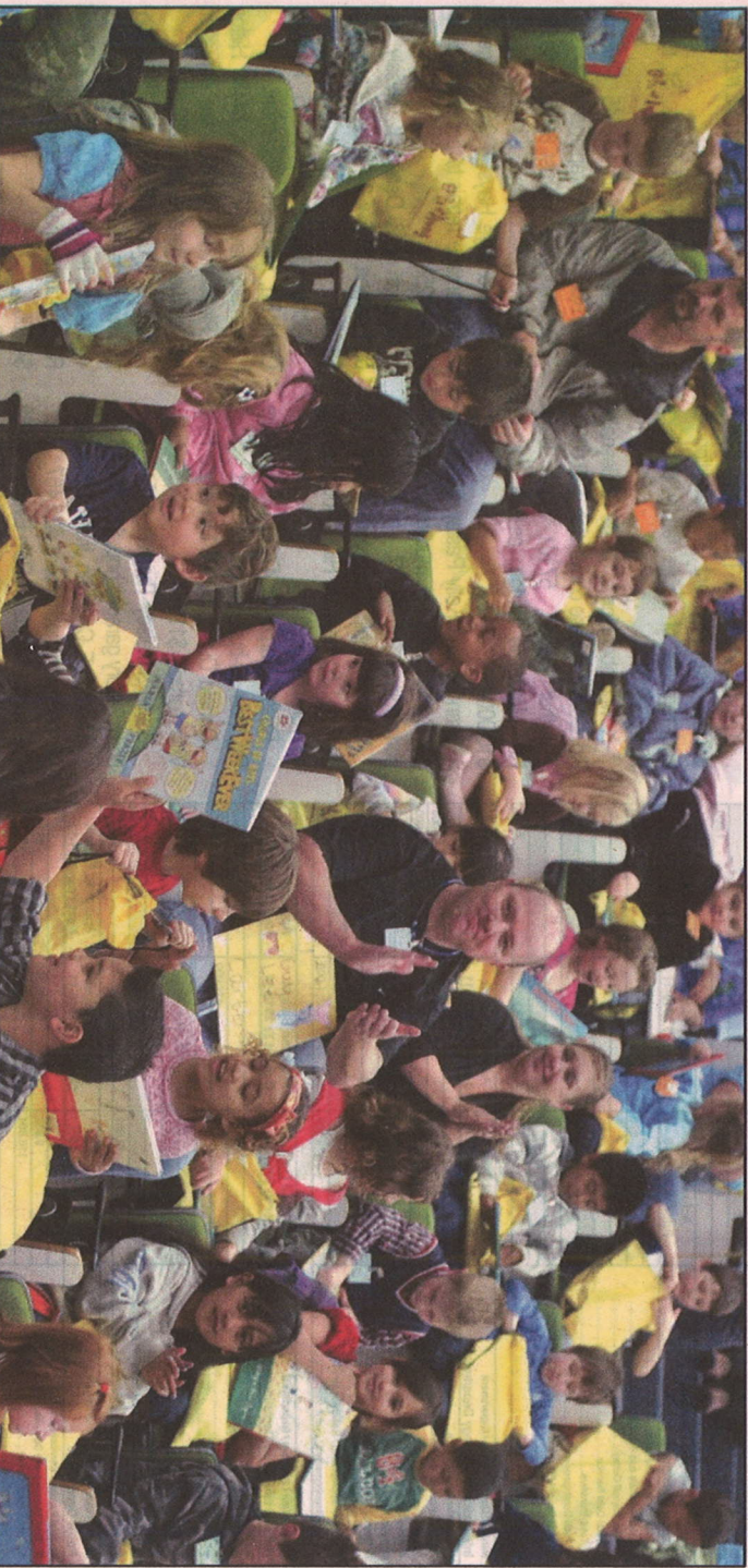
Springfield first graders grab their new books during the sixth annual Gift of Literacy event last Thursday at Lane Community College.