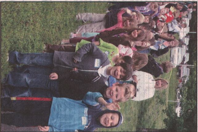
First graders from Page Elementary react to seeing mascots during the sixth annual Gift of Literacy.