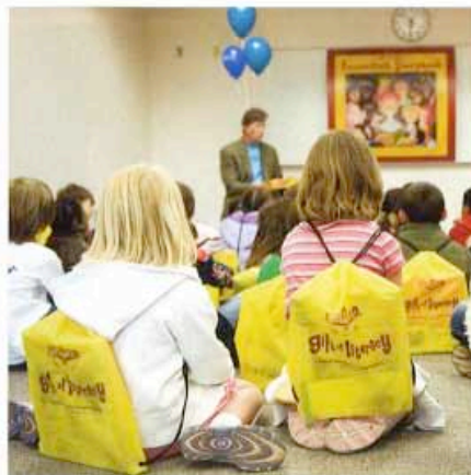
The school board, in partnership with the local Rotary Clubs, raises money from the community to pay for the program.