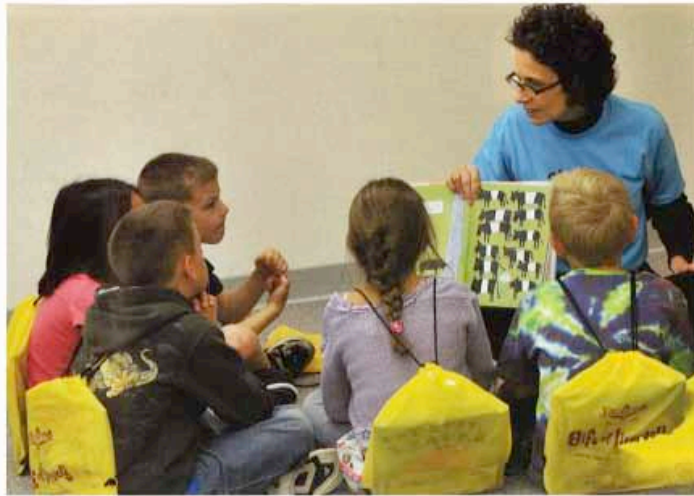
School board members and other community volunteers read aloud to Springfield first-graders during the annual reading celebration held at a local community college.

THIS PROGRAM PROMOTES LITERACY AND PROVIDES THE OPPORTUNITY FOR STUDENTS, PARENTS, TEACHERS, AND COMMUNITY MEMBERS TO BE ENGAGED IN READING IN NEW AND EXCITING WAYS.